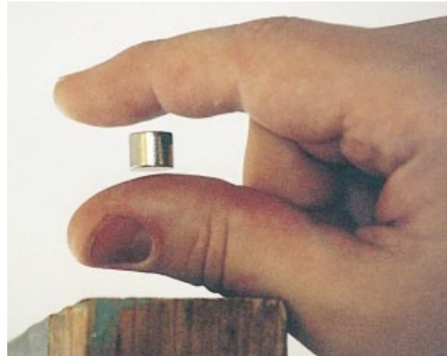
Geim, A. K. et al. Nature 400, 323-324 (1999)